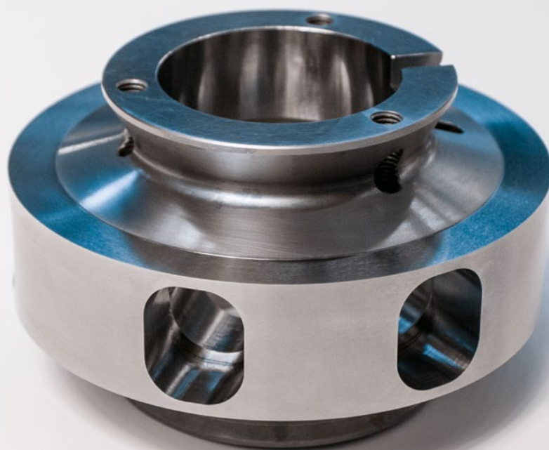
Clean result: a steel component made with a cooling lubricant containing NOVOTEC® CL800, 1.2379 HRC 60–62.

chips from which the mineral oil contamination cannot be extracted. Wenk was also very positive when it came to the use of rarely used machines: "In the past, we had to replace the cooling lubricant every six months because it had degraded. Now we have been working on one of these machines for two years with the same product." The fact that cooling lubricants with NOVOTEC® CL800 provide a clean solution is also evident in the production environment. "The oil mist that used to be everywhere is gone. The machine tools, their surroundings and the floor now stay much cleaner." And what do the employees say? "They were happy because their work has become much more pleasant. Their hands are no longer covered in oil, and the air stays clean." Wenk wanted to be sure of the latter and commissioned the employers' liability insurance association to conduct an analysis of the air. The positive result: no harmful substances were detected. After four years, Wenk concludes: "For all companies that machine and grind in particular, I can recommend switching to cooling lubricants containing NOVOTEC® CL800."