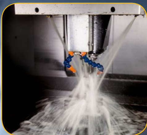
In use at cwTec: cooling lubricant containing NOVOTEC® CL800.

chips from which the mineral oil contamination cannot be extracted. Wenk was also very positive when it came to the use of rarely used machines: "In the past, we had to replace the cooling lubricant every six months because it had degraded. Now we have been working on one of these machines for two years with the same product." The fact that cooling lubricants with NOVOTEC® CL800 provide a clean solution is also evident in the production environment. "The oil mist that used to be everywhere is gone. The machine tools, their surroundings and the floor now stay much cleaner." And what do the employees say? "They were happy because their work has become much more pleasant. Their hands are no longer covered in oil, and the air stays clean." Wenk wanted to be sure of the latter and commissioned the employers' liability insurance association to conduct an analysis of the air. The positive result: no harmful substances were detected. After four years, Wenk concludes: "For all companies that machine and grind in particular, I can recommend switching to cooling lubricants containing NOVOTEC® CL800."