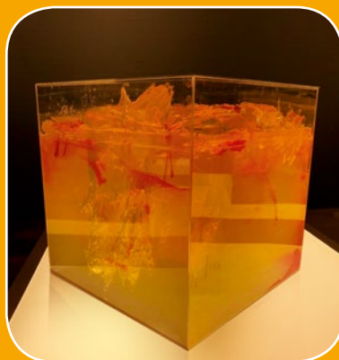
The Stigma art installation is dedicated to the subject of Genetic Sexual Attraction (GSA). It is intended to encourage observers to reflect on society.