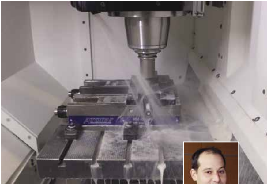
Heidelberger Druck uses Hakuform A805 metalworking fluid in turning and milling of steel, stainless steel, aluminum, non-ferrous metals and composites for increased tool life, broad suitability for different materials, less fluid consumption, fewer equipment maintenance issues, easier cleaning of machines and equipment parts, and improved skin tolerance of operators.

Proteins are a key performance factor in complex biological systems like the human body, where proteins help lubricate joints, stabilize bones and protect the skin. By transferring the technical knowledge of