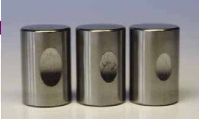
Figure 2. Test cylinders after Reichert wear test. Fluid used from left to right: Water, 5 percent standard MWF 5 percent NOVOTEC CL800.

resulted in the same low Reichert value as 5 percent of a standard synthetic fluid tested and left no residue (see Figure 2 ).