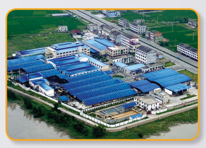
GELITA Pingyang Gelatine Co., Ltd.

As we foresee the China market becoming more and more important, we intend to open our third production plant at the end of 2013 for the production of high quality edible and pharmaceutical gelatines.